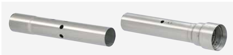
Standard fogging tube for oil-based fogging mixtures