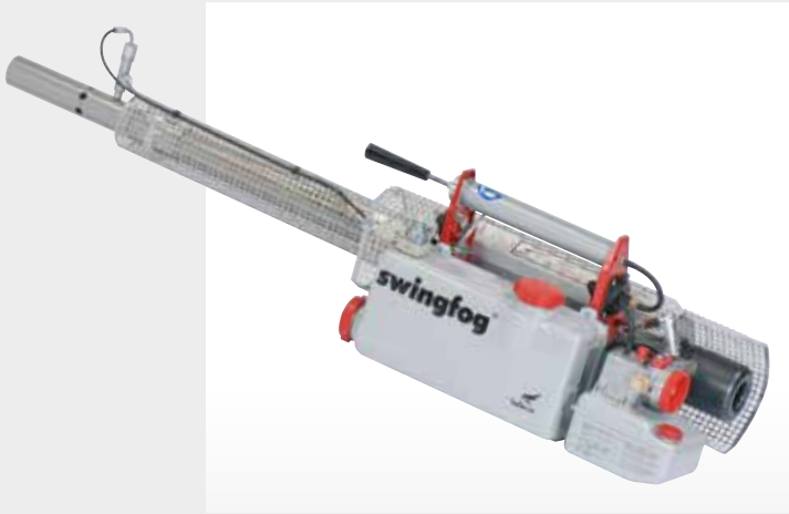
Swingfog SN 50